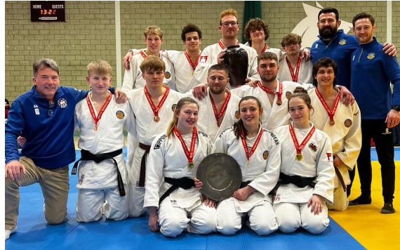
Teams plus coaches