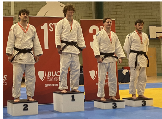
Gold U90kg, Luke full-time.

I have to say the dedication and commitment of these students I find awe inspiring! To go from a “standing start” to national medals in the time they have been training, is quite phenomenal.