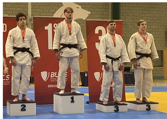
Silver U81kg, 'Cam' full-time.

I have put under the pictures of the medalists, their weight category as far as I remember, their starting date for those I have been coaching or the fact they are in the full-time programme. As I have little to do